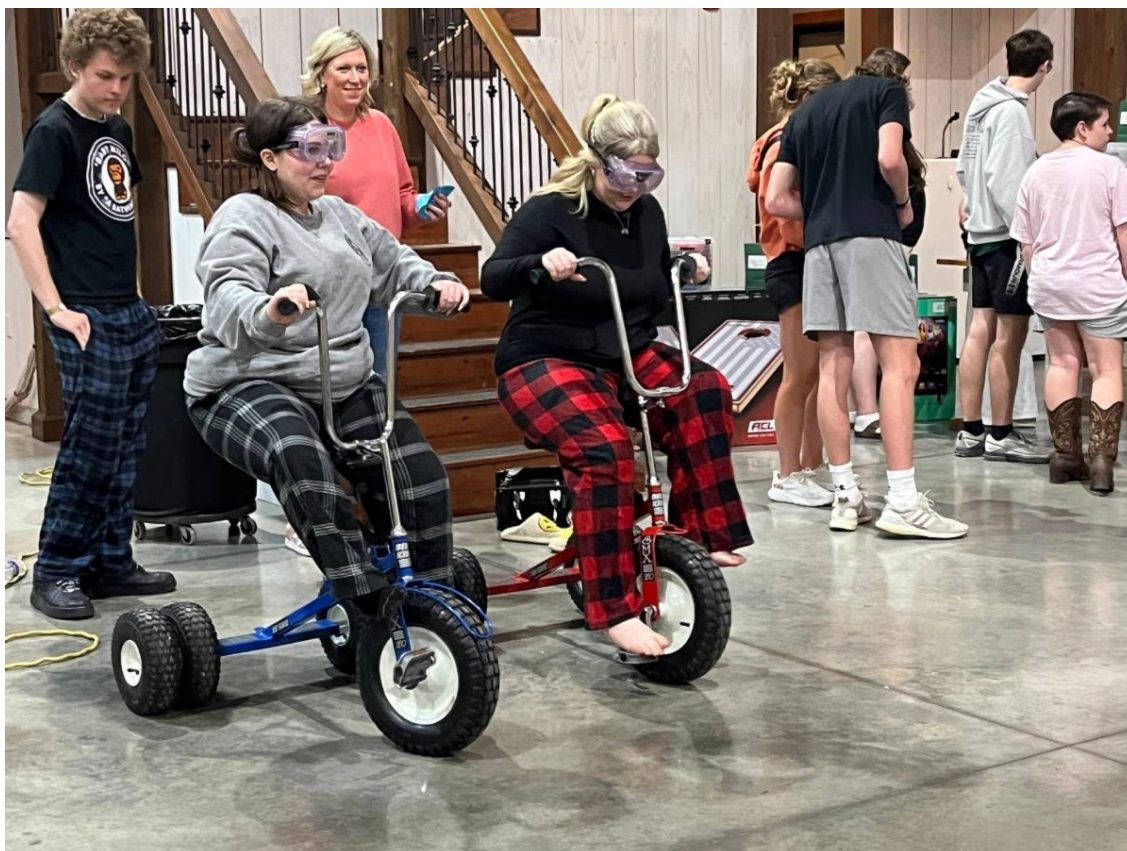
Basehor-Linwood High School