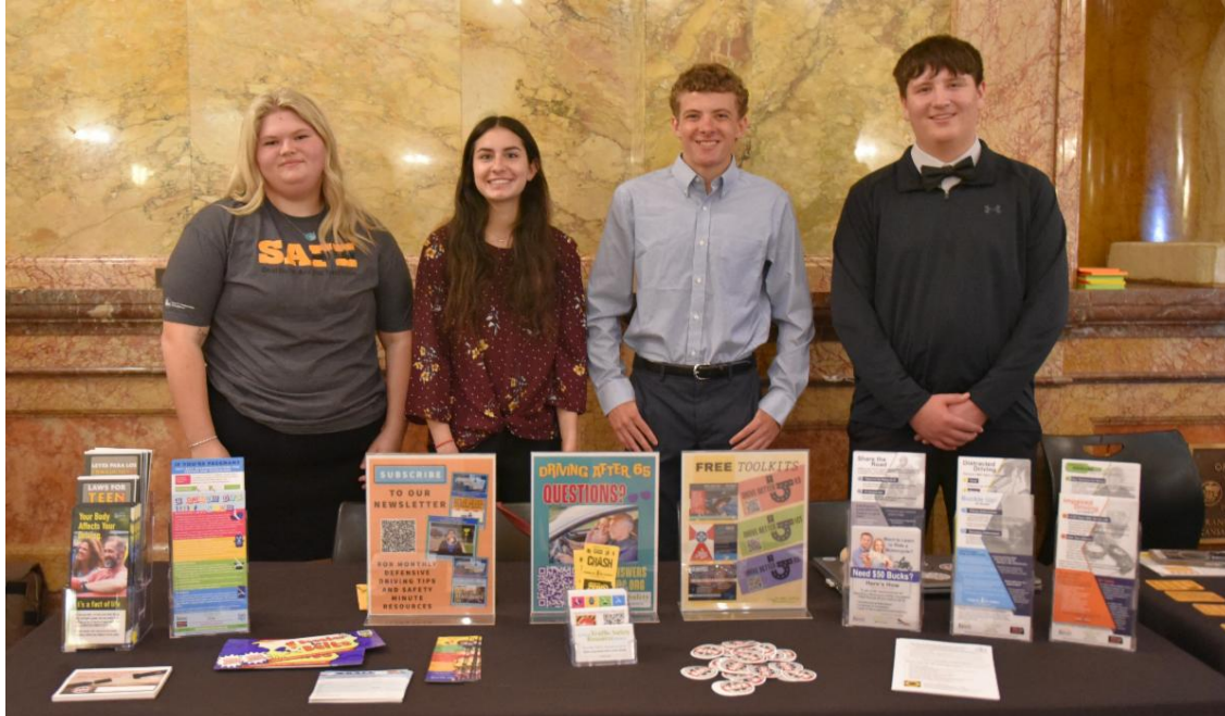
SAFE Student Board Members at Drive To Zero Day At The Capitol