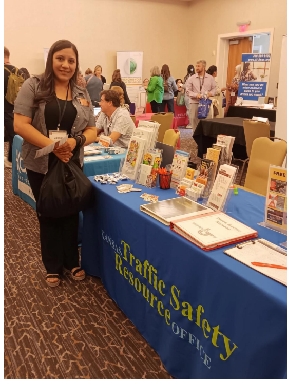
KTSRO talked with Governor's Public Health Conference attendees.