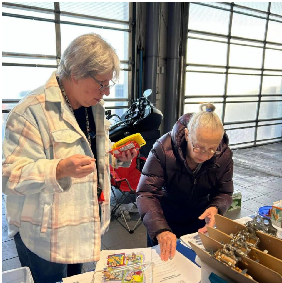
A check lane was held in Olathe so parents and caregivers could make sure their children's car seats were installed correctly.