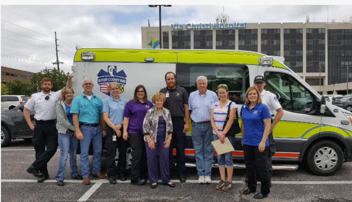
Training for EMS personnel at Via Christi Health in Wichita. Improving occupant protection for non-critical pediatric patients in an ambulance.