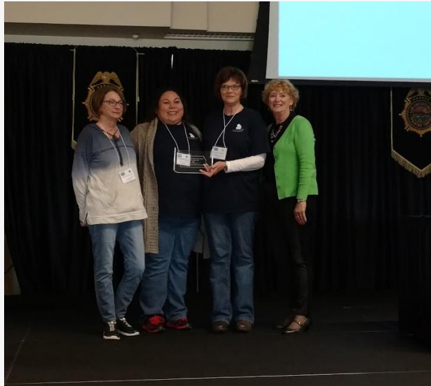
2017 CPS Station of the Year - City-Cowley County Health Department