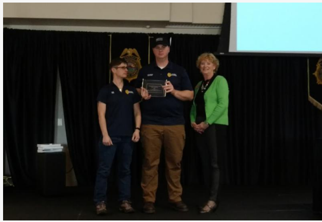
2017 CPS Station of the Year - Riley County Police Department